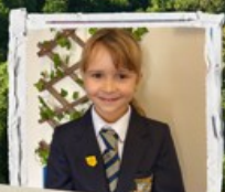
Yr 3 - River Tiber