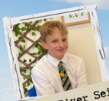
Yr 6 - River Seine