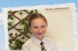
Yr 6 - River Seine