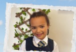
Yr 2 - River Danube