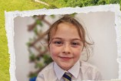
Yr 3 - River Tiber

'Treat others the way you want to be treated.'