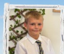
Yr 5 - River Avon