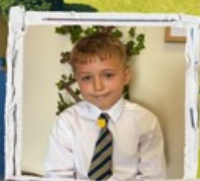
Yr 4 - River Thames