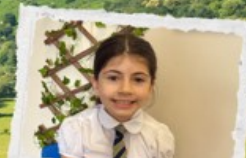
Yr 4 - River Thames