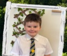
Yr 5 - River Avon