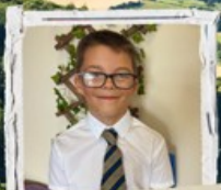
Yr 2 - River Danube